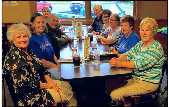
Members also got together on August 30 at The Other Place in Evansdale.