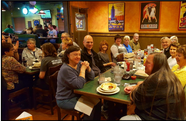
In April, we met at Old Chicago in Cedar Falls. What a big group of us there turned out to be!

P.E.T. P.A.L.S. members know how to have fun, so we try to get together as often as we can. Since the last newsletter, we've held two P.E.T. P.A.L.S. socials. Good food, conversation, and many laughs always accompany us at our socials. Information will be shared about our next one soon. Here are a few pictures of us getting together.