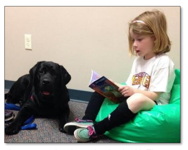
A young reader shares her book with Thor at the Denver Public Library.

Finally, Reading Pals took place at the Denver and Waverly Libraries along with Cedar Valley Preschool and Child Care Center in Cedar Falls. This was an opportunity for children to practice their fluency and expression as they read to dogs and even a cat.